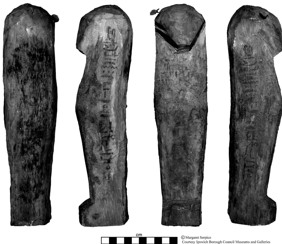
Fig. 1 - Ipswich Museum R.1992.89.40.

Three vertical columns of cursive hieroglyphs boldly written in black pigment extend down the front and sides of the figure; one on either side extend from the head to just above the feet and a central column starts at the waist and finishes at the point where the projection of the feet begins. The lower part of this central inscription is faded and the traces cannot be read. Six horizontal lines of faded/worn hieratic inscription, again in black, partly masked in places by patches of linen run across the chest and just above the central column.